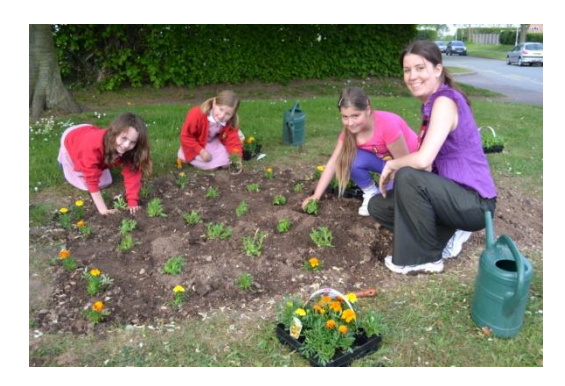
Planting the new

Further comments on the excellent children's poster display will be made in June.